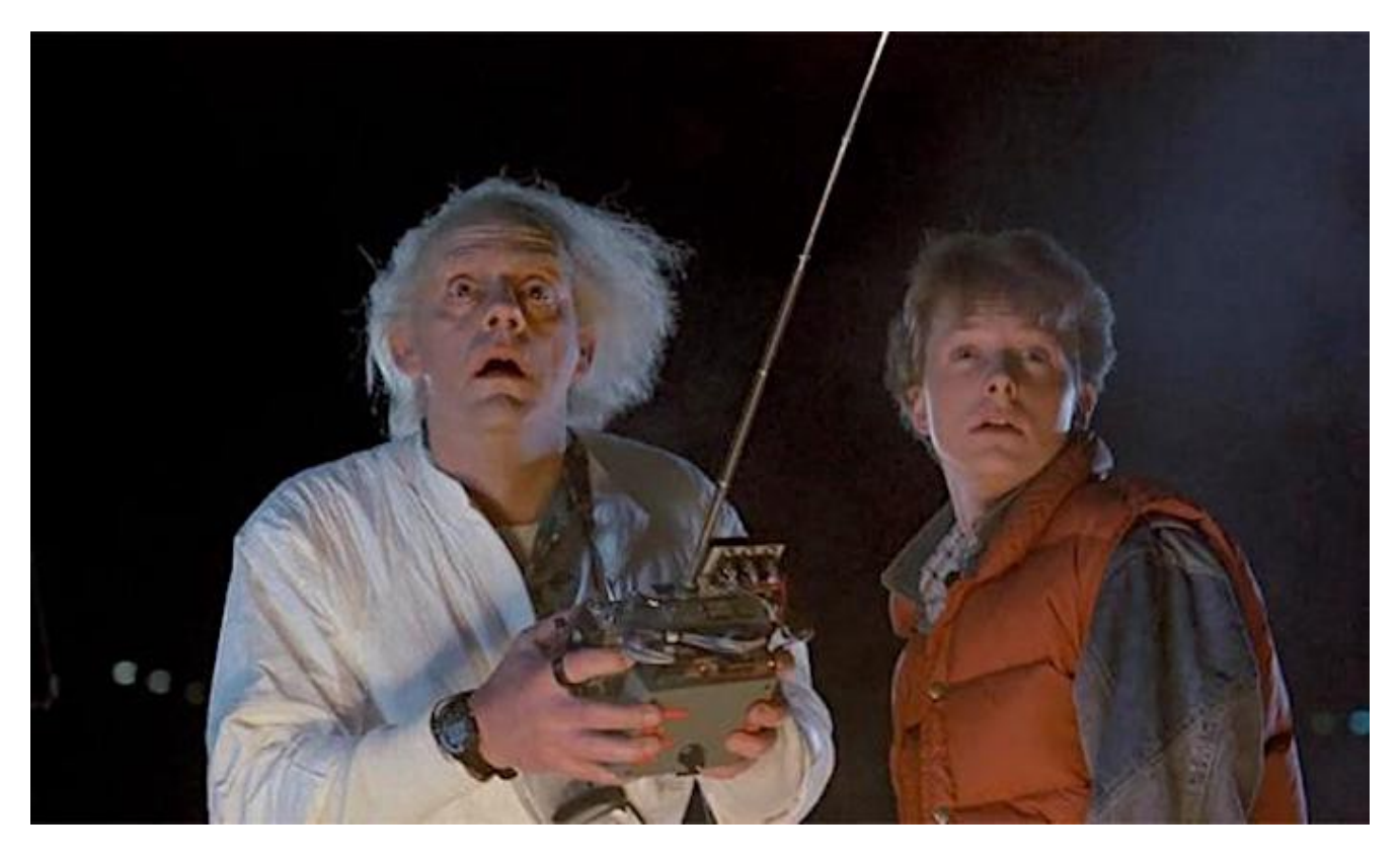
Doc Brown and Mary McFly in 'Back to the Future' is just one of many subplots in the movie.

As mentioned previously, subplots may consist of as few as three beats as well as many more. However, if you look at them in light of four major beats as outlined above, you will find them incredibly helpful in fleshing out your script.