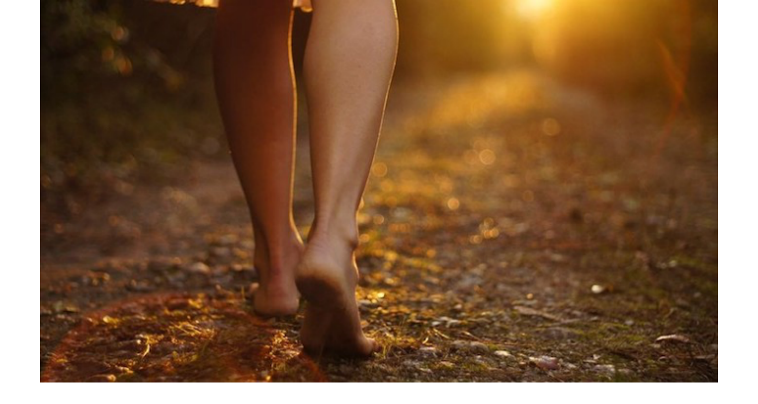
...but there is your way.