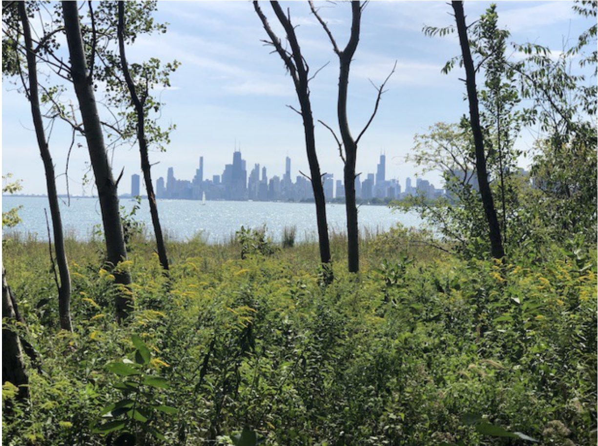
A view of the downtown Chicago skyline from the bird sanctuary on my jogging route

exercise, it's about getting outside . I don't listen to music, rather I want to hear and see the world around me. My current five-and-a-half mile route takes me through a variety of landscapes: Urban, park, dirt path, marina, bird sanctuary, another park, beach, and home.