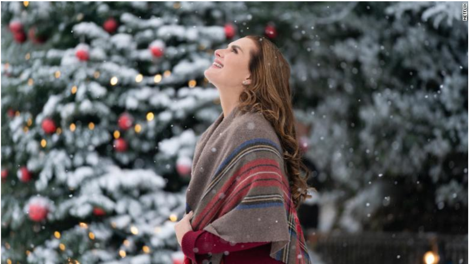
Brooke Shields in "A Castle For Christmas."

🕒 Updated 1759 GMT (0159 HKT) November 24, 2021